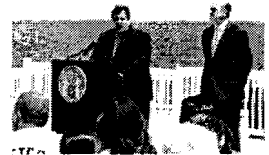
August 4, 2011 Clean Water