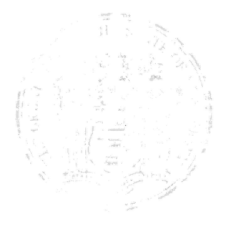
(Sponsorship Updated As Of: 5/6/2008)