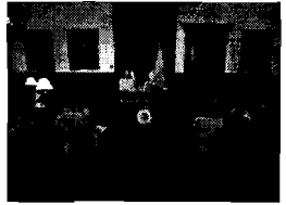
July 12, 2012 Bus Safety