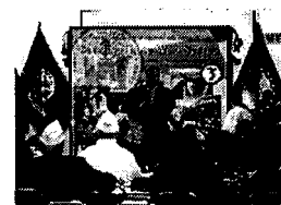
New Jersey National Guard Military Review September 29, 2013